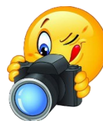
Photo Op ~ Bring real or artificial flowers to decorate our cross out front. Take pictures in your Easter finest!

Continental Breakfast will be available between services.